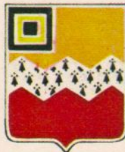
80th ARTILLERY REGIMENT Organized 21 June 1917 Toujours L'Audace