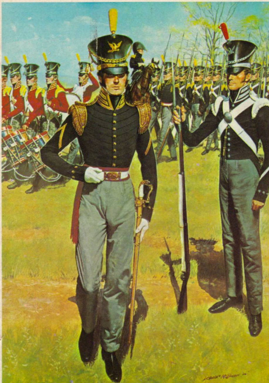
The Artillery School of Practice appears as it did in 1827. In the center foreground is a captain of artillery; in background is an artillery detachment headed by company musicians.