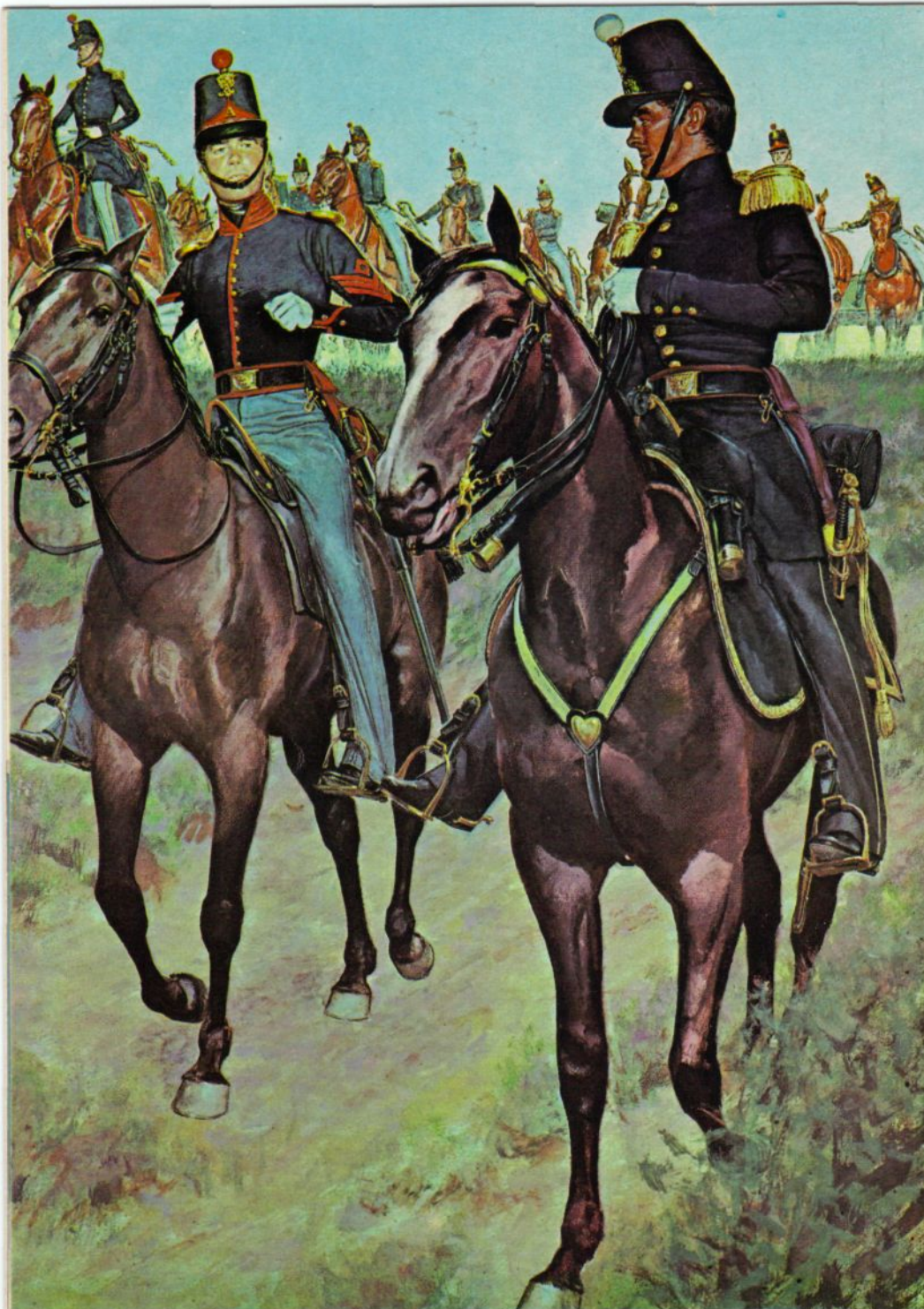
This scene of an Army post in 1855 includes a first sergeant of light artillery (left foreground).