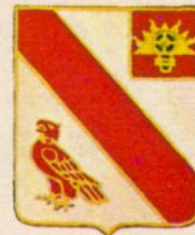
21st ARTILLERY REGIMENT Organized 1 June 1917 Progressi Sunt