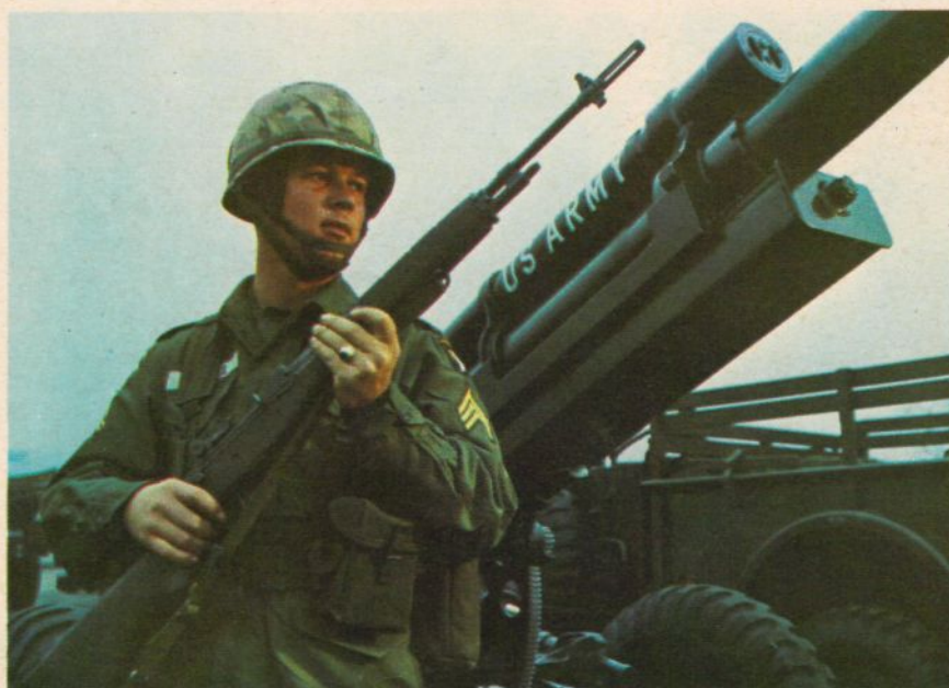
A gun crew chief stands at the ready in front of 105mm howitzer.