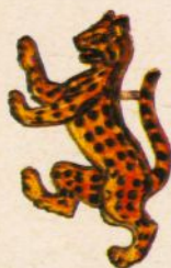
65th ARTILLERY REGIMENT Organized 26 December 1917 Sursum (Upwards)