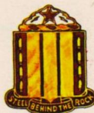
38th ARTILLERY REGIMENT Organized 17 August 1918 Steel Behind the Rock