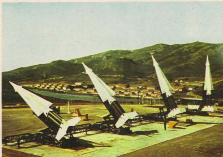
The Nike-Hercules surface-to-air guided missile system is designed for use against aircraft and tactical ballistic missiles.