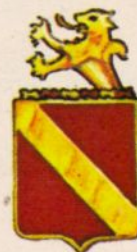
35th ARTILLERY REGIMENT Organized 9 August 1918 En Avant Toujours (Forward Always)