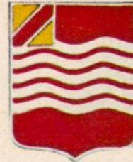
15th ARTILLERY REGIMENT Organized 1 June 1917 Allons