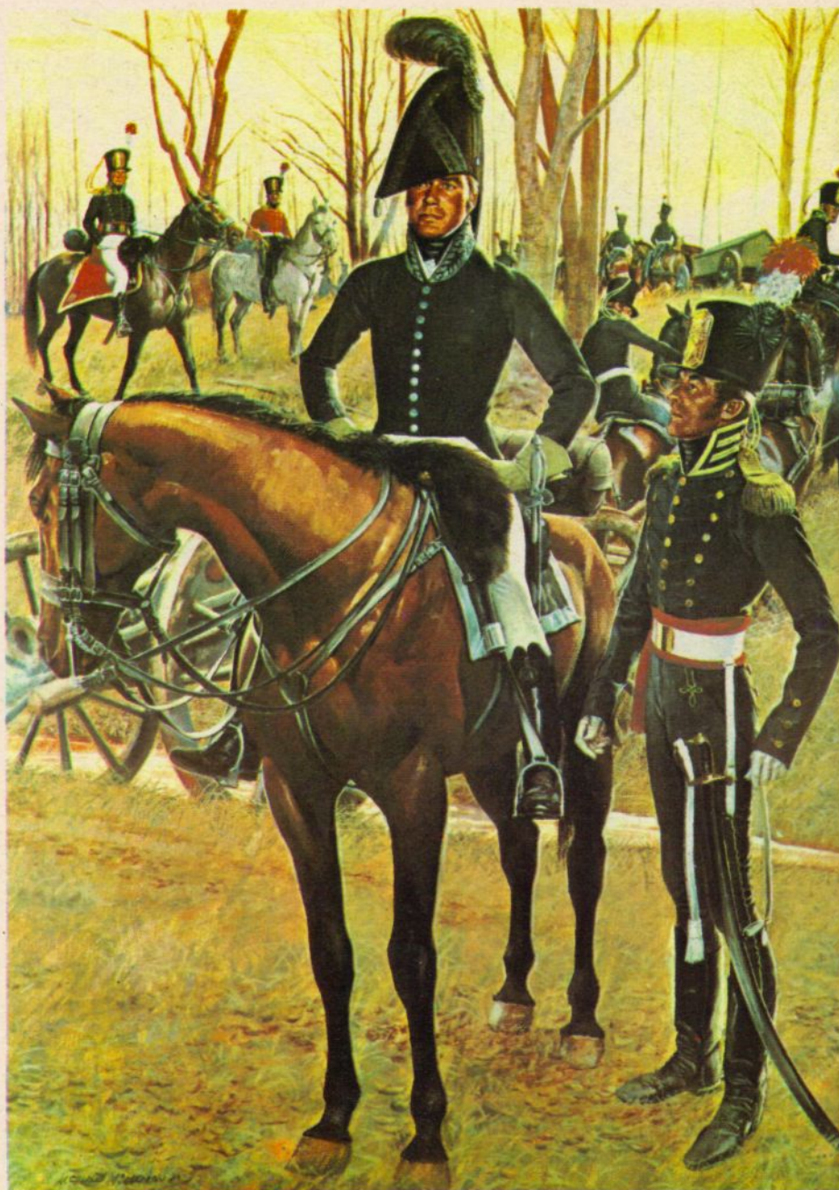
Attired in the uniform worn on the northern frontier in 1812, a sergeant of the light artillery regiment appears at right. In background is a trumpeter of the light artillery and a company of artillerymen.