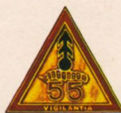
55th ARTILLERY REGIMENT Organized 1 December 1917 Vigilantia