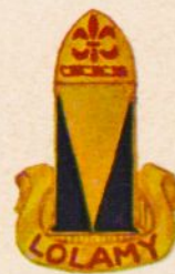
68th ARTILLERY REGIMENT Organized 1 June 1918 Lolamy (Can do)