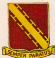
52d ARTILLERY REGIMENT Organized 22 July 1917 Semper Paratus