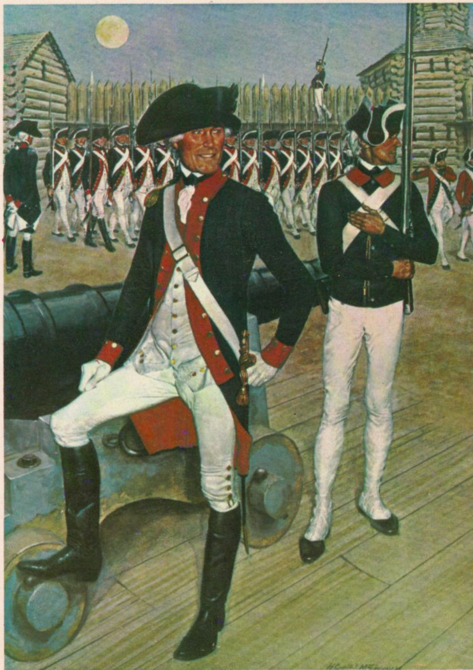
At a frontier fort on the Ohio River in 1786, a captain of artillery (left foreground) wears a cocked hat with the national cockade and an epaulette on his right shoulder.