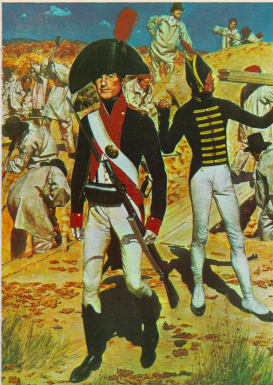
This 1805 scene of construction work near West Point, New York, includes an artillery cadet in the uniform of the period (left foreground).