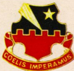
60th ARTILLERY REGIMENT Organized 23 December 1917 Coelis Imperamus (We Rule the Heavens)