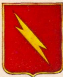
73d ARTILLERY REGIMENT Organized 12 October 1918 No Motto